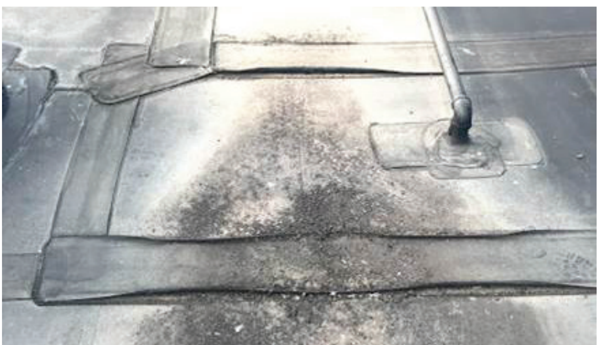
Roof Issues / Repeated Patching